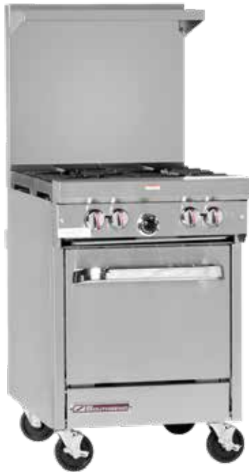
S24E (shown with optional casters)